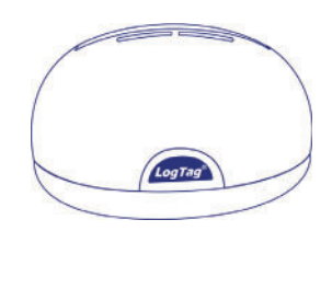
LTI HID Not Included