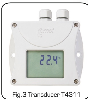
Fig. 3 Transducer T4311