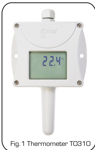
Fig. 1 Thermometer T0310

Barometer enables to measure sea level pressure by setting of correction to altitude above sea level.