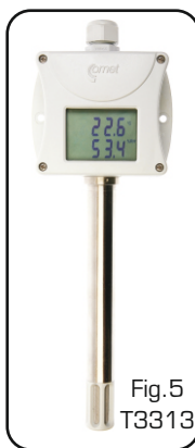
Fig. 5 T3313