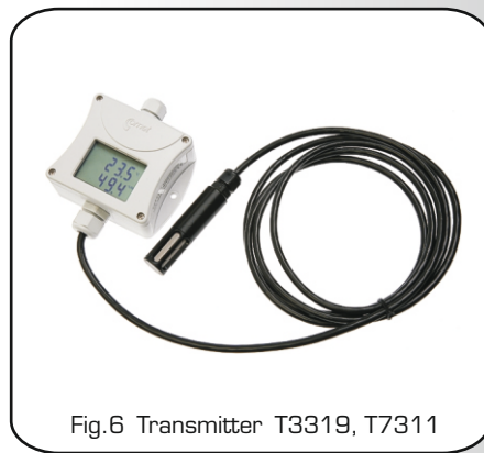
Fig. 6 Transmitter T3319, T7311