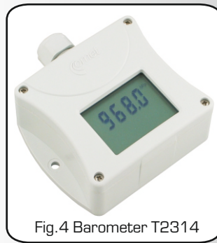
Fig. 4 Barometer T2314