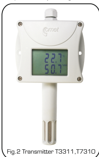
Fig. 2 Transmitter T3311, T7310